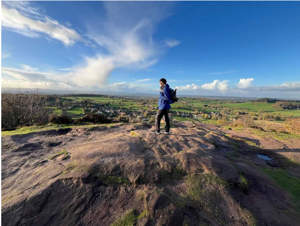
📷 Phoebe Smith hiking the Sandstone Trail in Cheshire.