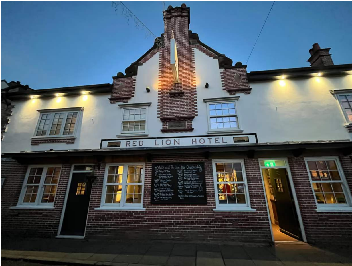
📷 The Lion in Malpas.

We traced the edges of Maiden Castle – the remains of an iron age hill fort built between 500 and 600BC and still occupied when the Romans arrived in Britain – before descending to country lanes, where someone had kindly left a wheelbarrow of apples for hikers.