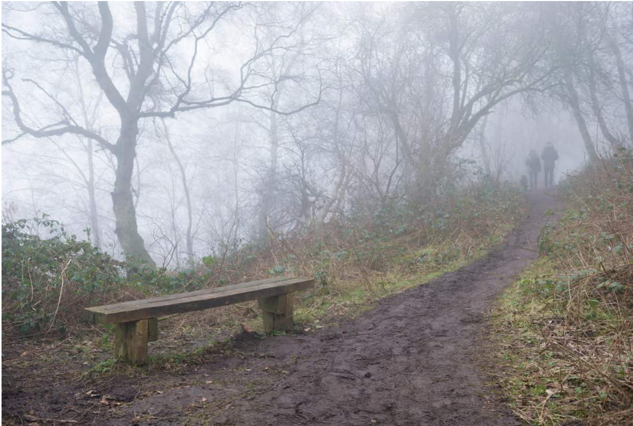
📷 Fog cloaks the trail high on the Sandstone Ridge.

We cut through a muddy field, making a beeline for this landmark, then followed the Sandstone Trail waymarks over the Shropshire Union Canal at Wharton's Lock. We reached the tall red walls of rubble-filled sandstone blocks and huge wooden doors of the castle, said to house treasure from Richard II.