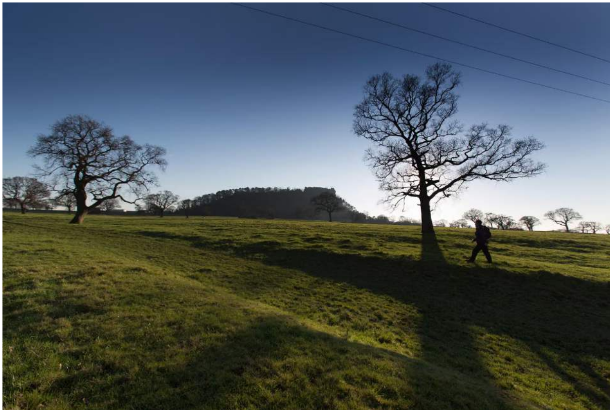
📷 A walker on the Sandstone Trail near Beeston Castle.

Sandstone Ridge , an ancient landscape of escarpments and rolling hills, rising from the Cheshire Plain.