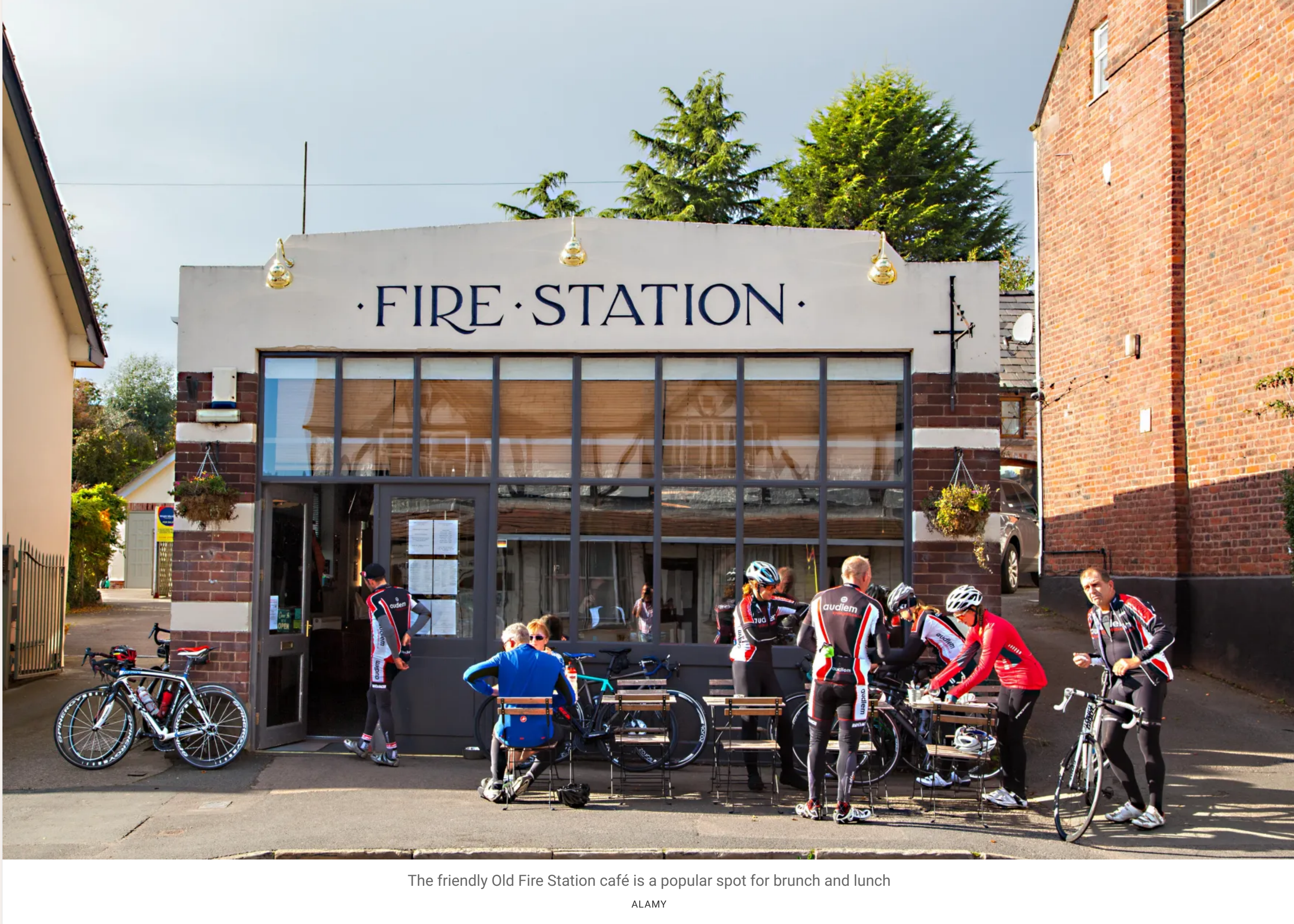
The friendly Old Fire Station café is a popular spot for brunch and lunch

The countryside is lush and lovely, a dog-walker's delight from every doorstep, but it's the amenities that make Malpas stand out. Practicalities are covered by convenience stores, the medical centre, dentist and pharmacy, a dry cleaner and tiny launderette, along with all the necessary grooming options for both humans and their furry best friends. Families are drawn by the two schools, keeping the age profile on the right side of too old.